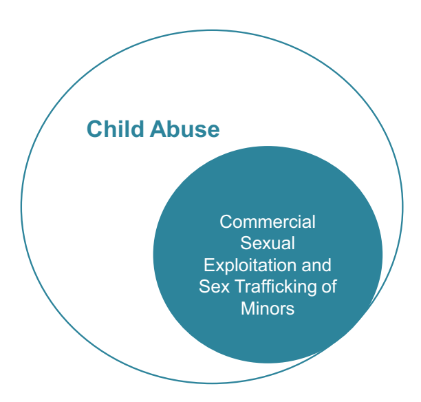
FIGURE 1 Commercial sexual exploitation and sex trafficking of minors are forms of child abuse.

NOTE: This diagram is for illustrative purposes only; it does not indicate or imply percentages.